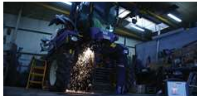
Agricultural and farm equipment maintenance