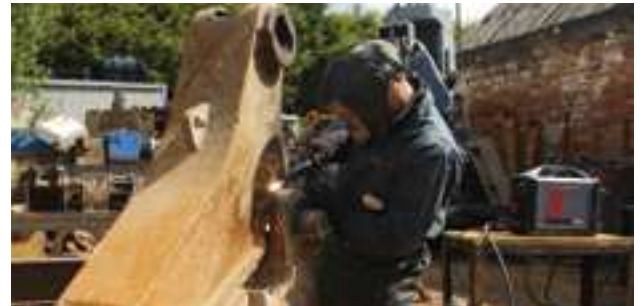
Maintenance and repair