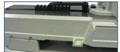
Quick Action Vice