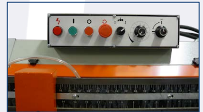
Clear, Simple Controls