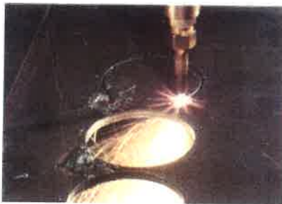
Oxy-fuel flame cutting machine

You don't need a computer wizard to operate the new BURNY ® 2.5. It's the easiest to use, and most cost-efficient CNC control available today for X-Y coordinate drive shape cutting machines: oxy-fuel or plasma. By a simple touch of the front control panel, an operator can conjure up to 50 commonly used shapes from its library storage, specify the respective dimensions, and then input the number of parts to be cut. Chain cutting of selected parts is just as easy. And with options, you can create and edit programs, receive downloaded information and even conduct two-way communications with off-line programming systems.