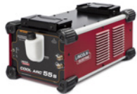
Shown: Cool Arc 55 S

Designed to integrate with Power Wave S350 and S500 power sources to cool water-cooled welding guns or torches rated up to 500 amps. Recommended for and hand-held MIG, TIG and Plasma cutting operations. 115V/1/60. The 55 S model includes an ArcLink communication flow sensor that detects water flow to prohibit welding when no flow is present. Order K3086-1 for Cool Arc 55 Order K3086-2 for Cool Arc 55 S