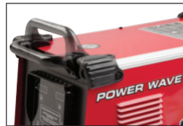
Reversible handles shown