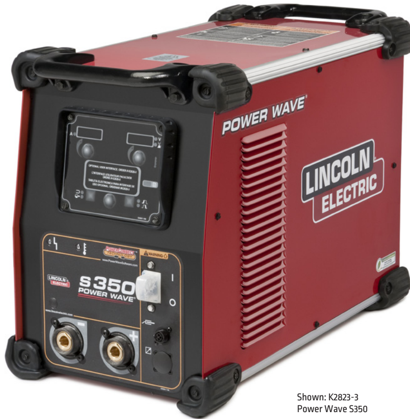
Shown: K2823-3 Power Wave S350