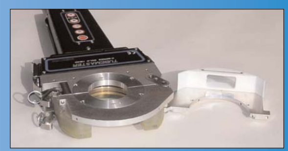
Glass View Port