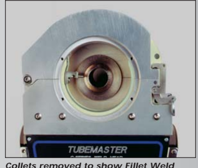
Collets removed to show Fillet Weld