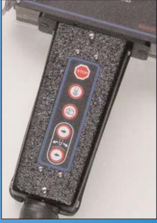
All Operating Controls mounted on Head