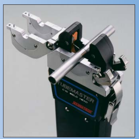
Simple Fit-Up and Clamping