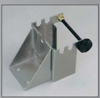
Bench Mount Bracket